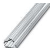
Cover profile, length: 300 mm, color: transparent