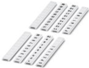
Zack marker strip flat, 10-section, horizontally labeled with the consecutive numbers: 1 ... 10, white, width: 5 mm

Please be informed that the data shown in this PDF Document is generated from our Online Catalog. Please find the complete data in the user's documentation. Our General Terms of Use for Downloads are valid ( http://phoenixcontact.com/download )