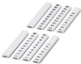
Zack marker strip flat, 10-section, horizontally labeled with the consecutive numbers: 81 ... 90, white

Please be informed that the data shown in this PDF Document is generated from our Online Catalog. Please find the complete data in the user's documentation. Our General Terms of Use for Downloads are valid ( http://phoenixcontact.com/download )