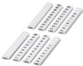
Zack marker strip flat, 10-section, horizontally labeled with the consecutive numbers: 61 ... 70, white

Please be informed that the data shown in this PDF Document is generated from our Online Catalog. Please find the complete data in the user's documentation. Our General Terms of Use for Downloads are valid ( http://phoenixcontact.com/download )