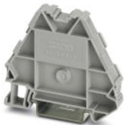
Spacer plate, length: 63.6 mm, width: 8.3 mm, height: 54 mm, color: gray

Please be informed that the data shown in this PDF Document is generated from our Online Catalog. Please find the complete data in the user's documentation. Our General Terms of Use for Downloads are valid ( http://phoenixcontact.com/download )