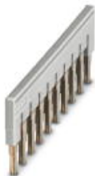
Plug-in bridge, Number of positions: 10, Color: gray

Please be informed that the data shown in this PDF Document is generated from our Online Catalog. Please find the complete data in the user's documentation. Our General Terms of Use for Downloads are valid ( http://phoenixcontact.com/download )