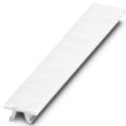
Zack marker strip, 10-section, horizontally labeled with the consecutive numbers: 21 ... 30, white, width: 6 mm

Please be informed that the data shown in this PDF Document is generated from our Online Catalog. Please find the complete data in the user's documentation. Our General Terms of Use for Downloads are valid ( http://phoenixcontact.com/download )