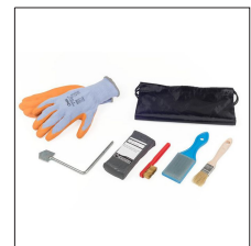
AT-069N Basic tool set Apliweld-E