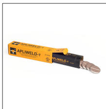
AT-020N Apliweld-T: Welding tablets (20u)