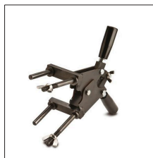
AT-049N Model S clamp for specific moulds