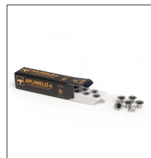
AT-010N Apliweld-E: Electronic starter (10ud)