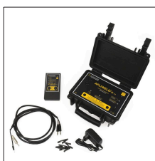
AT-100N Kit Apliweld-E: Ignition kit