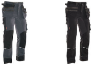
Dark Grey/Black (9899)