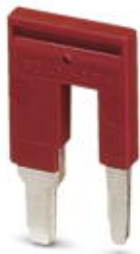
Reducing bridge, Number of positions: 2, Color: red

Please be informed that the data shown in this PDF Document is generated from our Online Catalog. Please find the complete data in the user's documentation. Our General Terms of Use for Downloads are valid ( http://phoenixcontact.com/download )