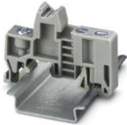
End clamp, for assembly on NS 32 or NS 35/7.5 DIN rail

Please be informed that the data shown in this PDF Document is generated from our Online Catalog. Please find the complete data in the user's documentation. Our General Terms of Use for Downloads are valid ( http://phoenixcontact.com/download )