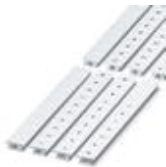
Zack marker strip, Strip, white, unlabeled, can be labeled with: Plotter, Mounting type: Snap into tall marker groove, for terminal block width: 10.2 mm, Lettering field: 10.5 x 10.15 mm

Zack marker strip - ZB 10:UNBEDRUCKT - 1053001