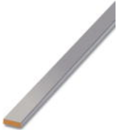
PEN conductor busbar, 3mm x 10 mm, length: 1000 mm

Please be informed that the data shown in this PDF Document is generated from our Online Catalog. Please find the complete data in the user's documentation. Our General Terms of Use for Downloads are valid ( http://phoenixcontact.com/download )