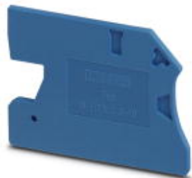
Cover, for the UTN 2,5, UTN 4, UTN 6, UTN 10 terminal blocks

Please be informed that the data shown in this PDF Document is generated from our Online Catalog. Please find the complete data in the user's documentation. Our General Terms of Use for Downloads are valid ( http://phoenixcontact.com/download )