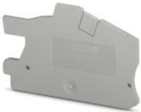
End cover, length: 66 mm, width: 2.2 mm, height: 42.3 mm, color: gray

Please be informed that the data shown in this PDF Document is generated from our Online Catalog. Please find the complete data in the user's documentation. Our General Terms of Use for Downloads are valid ( http://phoenixcontact.com/download )