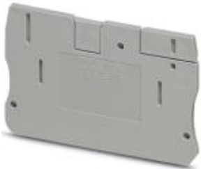
End cover, length: 57.7 mm, width: 2.2 mm, height: 42 mm, color: gray

Please be informed that the data shown in this PDF Document is generated from our Online Catalog. Please find the complete data in the user's documentation. Our General Terms of Use for Downloads are valid ( http://phoenixcontact.com/download )