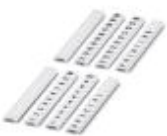
Zack Marker strip, flat, Strip, white, labeled, printed horizontally: Consecutive numbers 1 - 10, 11 - 20, etc. up to 491 - 500, Mounting type: snap into flat marker groove, for terminal block width: 5 mm, Lettering field: 5.15 x 5.15 mm

Zack Marker strip, flat - ZBF 5,LGS:FORTL.ZAHLEN - 0808671