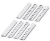
Zack Marker strip, flat, can be ordered: Strip, white, labeled according to customer specifications, Mounting type: snap into flat marker groove, for terminal block width: 5 mm, Lettering field: 5.15 x 5.15 mm

Zack Marker strip, flat - ZBF 5 CUS - 0825025