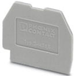
End cover, Length: 22 mm, Width: 1 mm, Color: gray

Please be informed that the data shown in this PDF Document is generated from our Online Catalog. Please find the complete data in the user's documentation. Our General Terms of Use for Downloads are valid ( http://phoenixcontact.com/download )