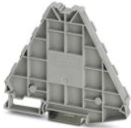
Spacer plate, length: 100 mm, width: 8.3 mm, height: 86 mm, color: gray

Please be informed that the data shown in this PDF Document is generated from our Online Catalog. Please find the complete data in the user's documentation. Our General Terms of Use for Downloads are valid ( http://phoenixcontact.com/download )