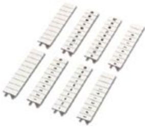
Zack marker strip, 10-section, horizontally labeled with the consecutive numbers: 11 ... 20, white, width: 5 mm

Please be informed that the data shown in this PDF Document is generated from our Online Catalog. Please find the complete data in the user's documentation. Our General Terms of Use for Downloads are valid ( http://phoenixcontact.com/download )