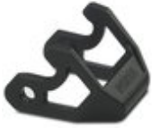
Replacement latch for HC-D7 housing

Housing brackets - HC-D07-SL-PLBK - 1424440