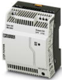
Primary-switched STEP POWER power supply for DIN rail mounting, input: 1-phase, output: 24 V DC/2.5 A

Please be informed that the data shown in this PDF Document is generated from our Online Catalog. Please find the complete data in the user's documentation. Our General Terms of Use for Downloads are valid ( http://phoenixcontact.com/download )