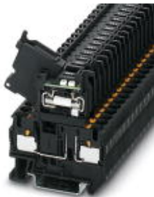
Lever-type fuse terminal block, black, for 5 x 20 mm G fuse inserts, with LED for 24 V DC

Please be informed that the data shown in this PDF Document is generated from our Online Catalog. Please find the complete data in the user's documentation. Our General Terms of Use for Downloads are valid ( http://phoenixcontact.com/download )