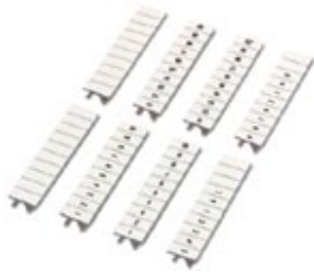
Zack marker strip, 10-section, horizontally labeled with the consecutive numbers: 131 ... 140, white, width: 5 mm

Please be informed that the data shown in this PDF Document is generated from our Online Catalog. Please find the complete data in the user's documentation. Our General Terms of Use for Downloads are valid ( http://phoenixcontact.com/download )