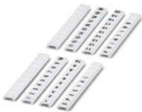
Zack marker strip flat, 10-section, horizontally labeled with the consecutive numbers: 141 ... 150, white

Please be informed that the data shown in this PDF Document is generated from our Online Catalog. Please find the complete data in the user's documentation. Our General Terms of Use for Downloads are valid ( http://phoenixcontact.com/download )