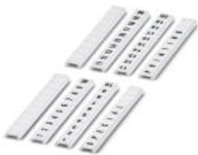
Zack marker strip flat, 10-section, horizontally labeled with the consecutive numbers: 131 ... 140, white

Please be informed that the data shown in this PDF Document is generated from our Online Catalog. Please find the complete data in the user's documentation. Our General Terms of Use for Downloads are valid ( http://phoenixcontact.com/download )