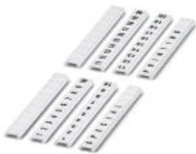
Zack marker strip flat, 10-section, horizontally labeled with the consecutive numbers: 91 ... 100, white

Please be informed that the data shown in this PDF Document is generated from our Online Catalog. Please find the complete data in the user's documentation. Our General Terms of Use for Downloads are valid ( http://phoenixcontact.com/download )