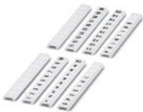
Zack marker strip flat, 10-section, horizontally labeled with the consecutive numbers: 71 ... 80, white

Please be informed that the data shown in this PDF Document is generated from our Online Catalog. Please find the complete data in the user's documentation. Our General Terms of Use for Downloads are valid ( http://phoenixcontact.com/download )