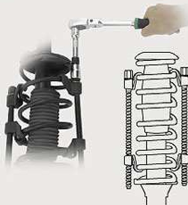
- 2PCS Coil Spring Compressor Set