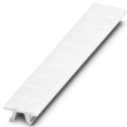
Zack marker strip, 10-section, horizontally labeled with the consecutive numbers: 11 ... 20, white, width: 6 mm

Please be informed that the data shown in this PDF Document is generated from our Online Catalog. Please find the complete data in the user's documentation. Our General Terms of Use for Downloads are valid ( http://phoenixcontact.com/download )