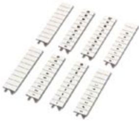
Zack marker strip, 10-section, horizontally labeled with the consecutive numbers: 81 ... 90, white, width: 5 mm

Please be informed that the data shown in this PDF Document is generated from our Online Catalog. Please find the complete data in the user's documentation. Our General Terms of Use for Downloads are valid ( http://phoenixcontact.com/download )