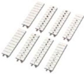
Zack marker strip, 10-section, horizontally labeled with the consecutive numbers: 51 ... 60, white, width: 5 mm

Please be informed that the data shown in this PDF Document is generated from our Online Catalog. Please find the complete data in the user's documentation. Our General Terms of Use for Downloads are valid ( http://phoenixcontact.com/download )