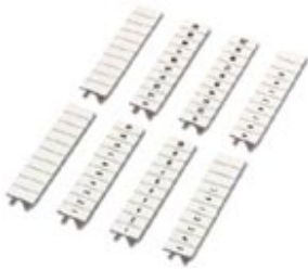
Zack marker strip, 10-section, horizontally labeled with the consecutive numbers: 41 ... 50, white, width: 5 mm

Please be informed that the data shown in this PDF Document is generated from our Online Catalog. Please find the complete data in the user's documentation. Our General Terms of Use for Downloads are valid ( http://phoenixcontact.com/download )