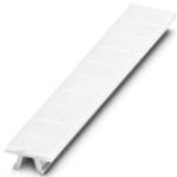
Zack marker strip, 10-section, horizontally labeled with the consecutive numbers: 41 ... 50, white, width: 6 mm

Please be informed that the data shown in this PDF Document is generated from our Online Catalog. Please find the complete data in the user's documentation. Our General Terms of Use for Downloads are valid ( http://phoenixcontact.com/download )