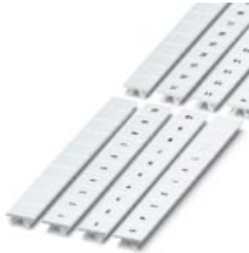
Zack marker strip, 10-section, horizontally labeled with the consecutive numbers: 21 ... 30, white

Please be informed that the data shown in this PDF Document is generated from our Online Catalog. Please find the complete data in the user's documentation. Our General Terms of Use for Downloads are valid ( http://phoenixcontact.com/download )