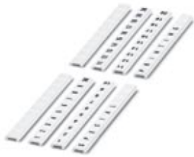
Zack marker strip flat, 10-section, horizontally labeled with the consecutive numbers: 51 ... 60, white

Please be informed that the data shown in this PDF Document is generated from our Online Catalog. Please find the complete data in the user's documentation. Our General Terms of Use for Downloads are valid ( http://phoenixcontact.com/download )