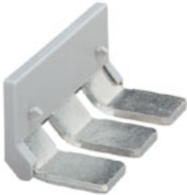
Insertion bridge, pitch: 36 mm, number of positions: 3, color: gray

Please be informed that the data shown in this PDF Document is generated from our Online Catalog. Please find the complete data in the user's documentation. Our General Terms of Use for Downloads are valid ( http://phoenixcontact.com/download )