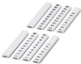
Zack marker strip flat, 10-section, horizontally labeled with the consecutive numbers: 31 ... 40, white

Please be informed that the data shown in this PDF Document is generated from our Online Catalog. Please find the complete data in the user's documentation. Our General Terms of Use for Downloads are valid ( http://phoenixcontact.com/download )