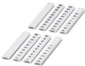
Zack marker strip flat, 10-section, horizontally labeled with the consecutive numbers: 51 ... 60, white

Please be informed that the data shown in this PDF Document is generated from our Online Catalog. Please find the complete data in the user's documentation. Our General Terms of Use for Downloads are valid ( http://phoenixcontact.com/download )