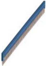
Plug-in bridge, pitch: 3.5 mm, number of positions: 50, color: blue

Please be informed that the data shown in this PDF Document is generated from our Online Catalog. Please find the complete data in the user's documentation. Our General Terms of Use for Downloads are valid ( http://phoenixcontact.com/download )