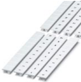
Zack marker strip, 10-section, horizontally labeled with the consecutive numbers: 1 ... 10, white, width: 10 mm

Please be informed that the data shown in this PDF Document is generated from our Online Catalog. Please find the complete data in the user's documentation. Our General Terms of Use for Downloads are valid ( http://phoenixcontact.com/download )